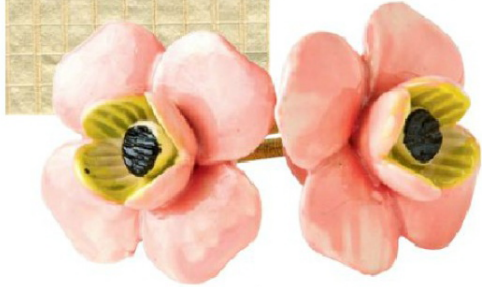
Dresser Hardware: Pink Poppy knob by Anthropologie