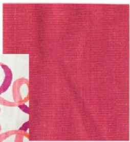
Bedskirt: linen in Rose (above)