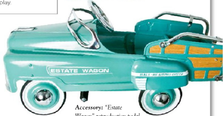
Accessory: "Estate Wagon" reproduction pedal car by American Retro